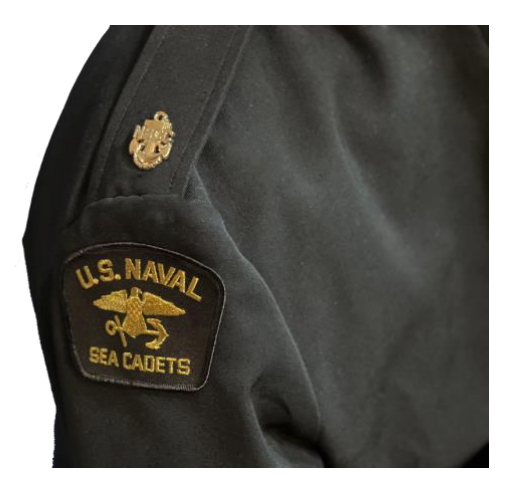
FIGURE 4-2-7 NSCC CHIEF PETTY OFFICER SOFT SHOULDER BOARDS AND METAL GRADE INSIGNIA