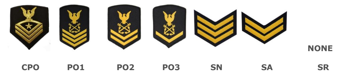
FIGURE 4-2-1 NSCC CADET CHEVRON AND RATING BADGES