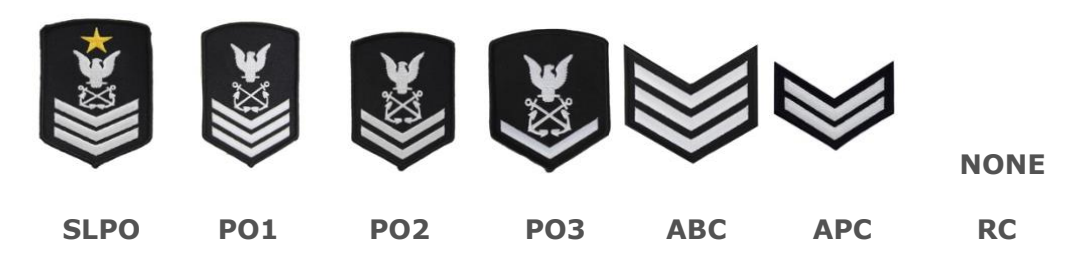
FIGURE 4-2-3 NLCC CADET CHEVRONS AND RATING BADGES